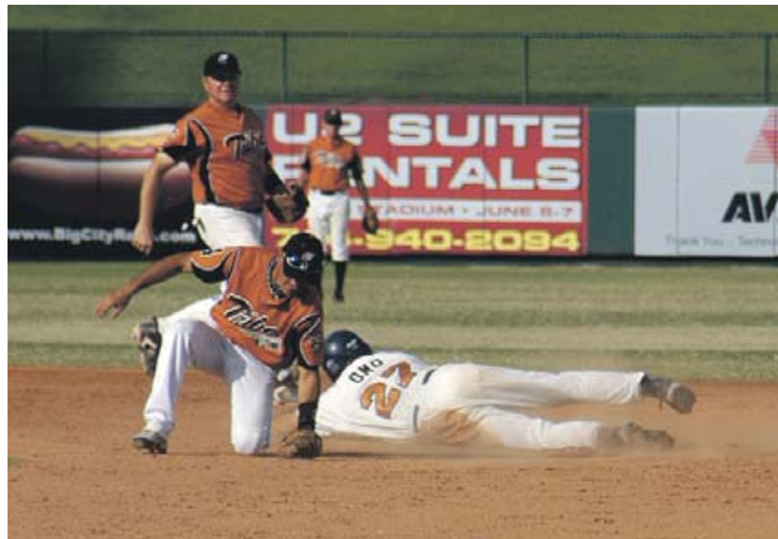
Stealing second base.