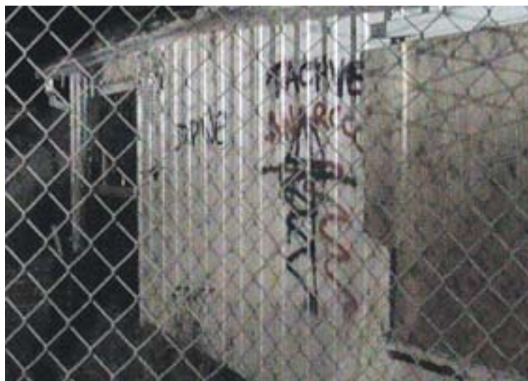
The Moraga Adobe emerges out of the hillside's inky gloom when two Orinda Police officers train their spotlights and flashlights on the structure.