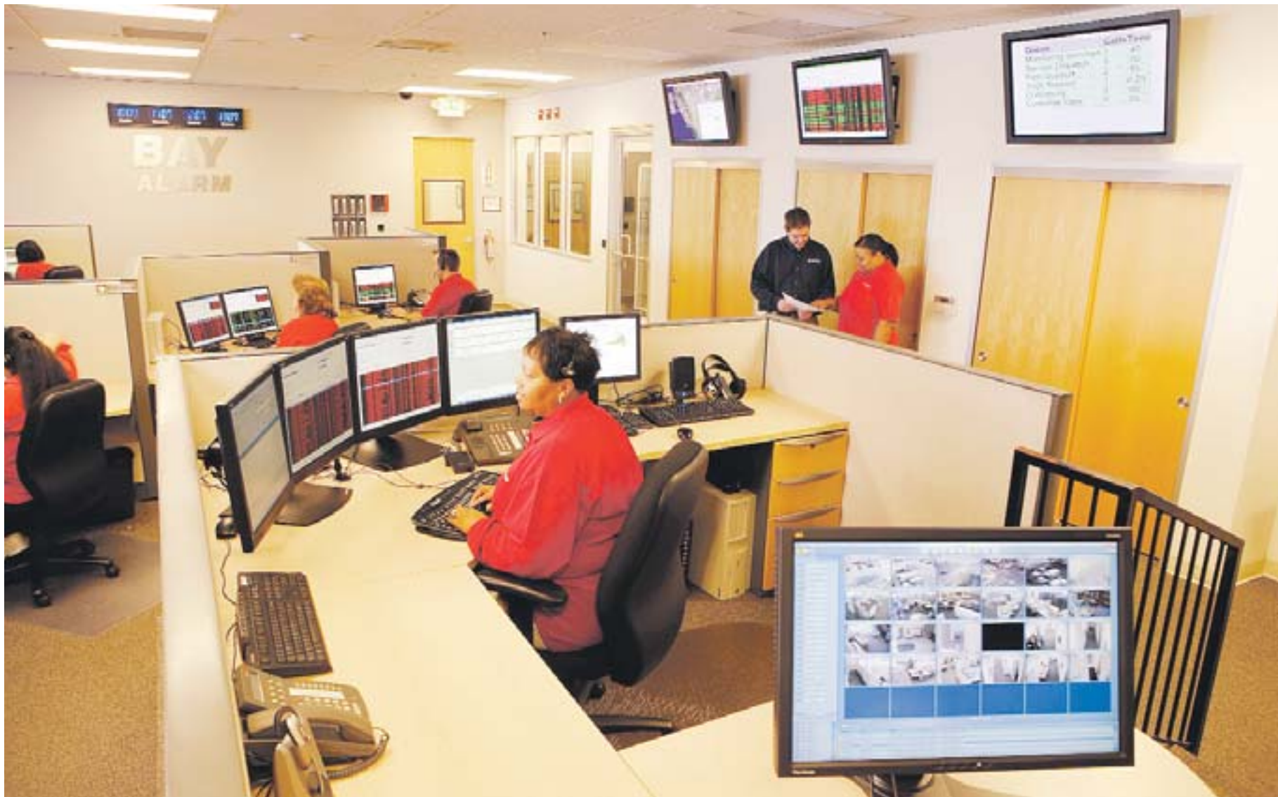
Technicians monitor home security systems at Bay Alarm Company.