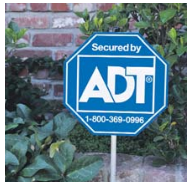
A sign in the front yard points out the security system