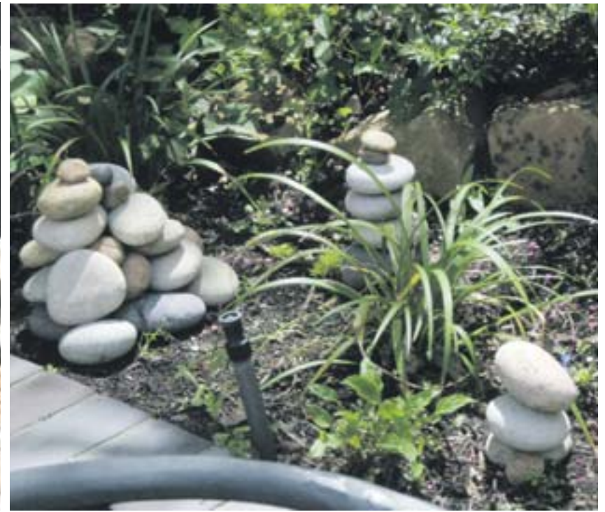
Cairns built by friends in Stu Selland's back yard