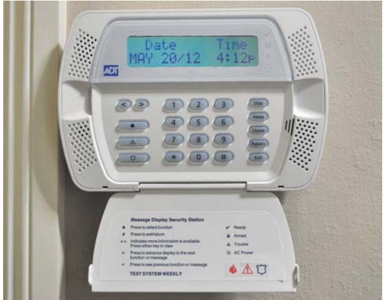
Typical security system control panel