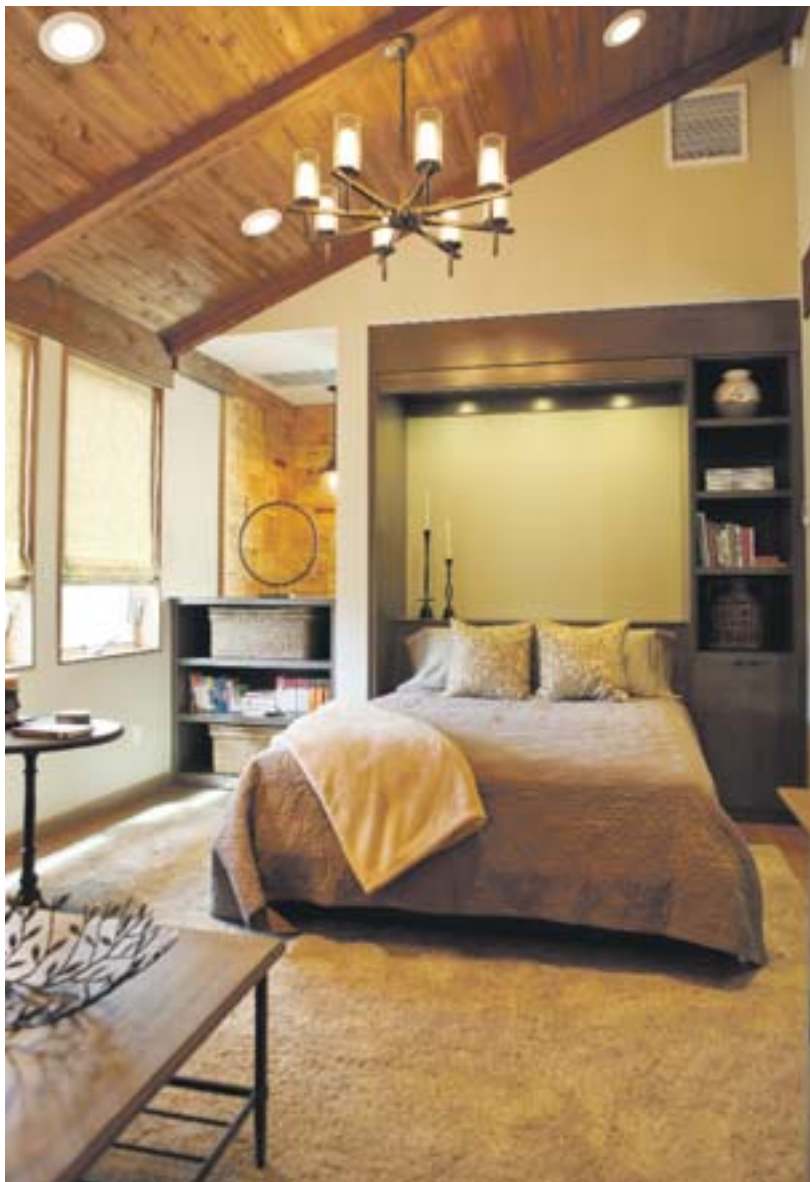
Studio with emblazed wood on wall behind