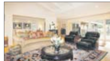
LAFAYETTE $2,850,000 5/5. Beautiful custom estate situated on approx. 2.4 private acres. Gated entrance, shared tennis ct, 2 pool sites. The Beaubelle Group 925-254-1212

5 Moraga Way | Orinda | 925.253.460 2 Theatre Square, Suite 211 | Orinda | 925.253.6300