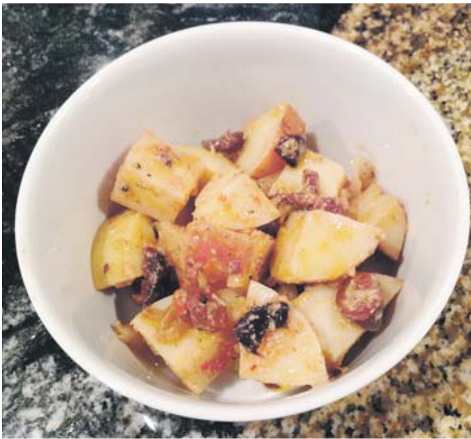
Mediterranean Potato Salad