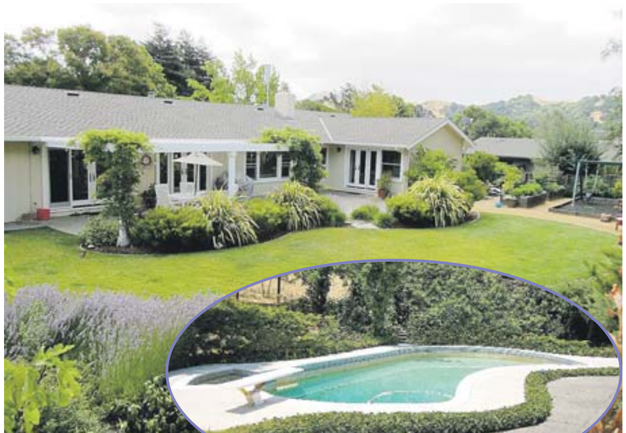
Current landscaping in the Thomas backyard shows little signs of the pool they removed when they bought their house.