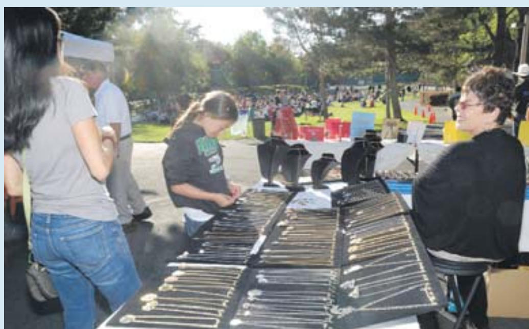
Art fans of all ages turned out in droves for the Orinda Arts Council's annual Arts in Bloom Festival at the Orinda Community Park July 17. Scoping out displays by area artisans while snacking on goodies from Loard's, attendees also were treated to a concert-in-the-park by 2012 Orinda Idol finalists on a perfect midsummer's eve.