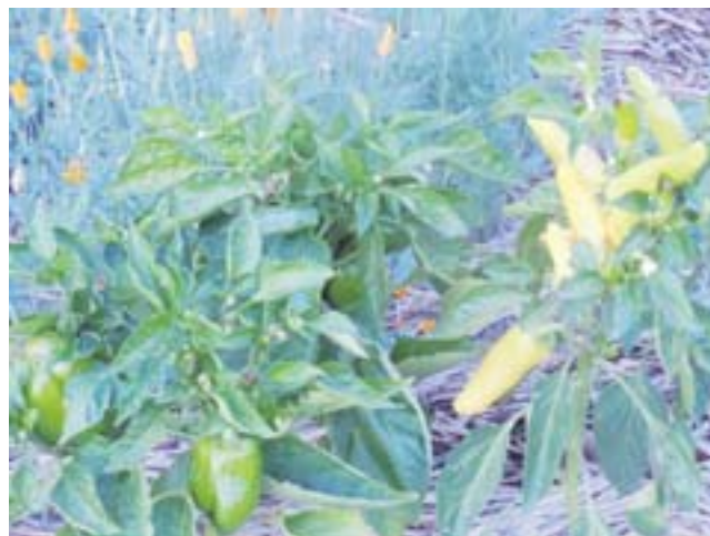
Peppers and poppies