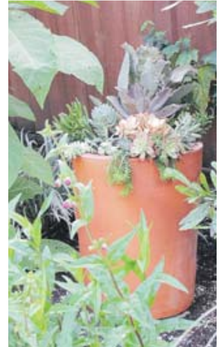
A succulent container

“Harmony and balance are crucial factors in Feng Shui and can be achieved on the physical level and on the energetic or quantum physics level,” says Catlin. “Many factors are taken into account including geological elements, positioning of structures within the environment, the architectural and interior layout of a space, and the inhabitants.”