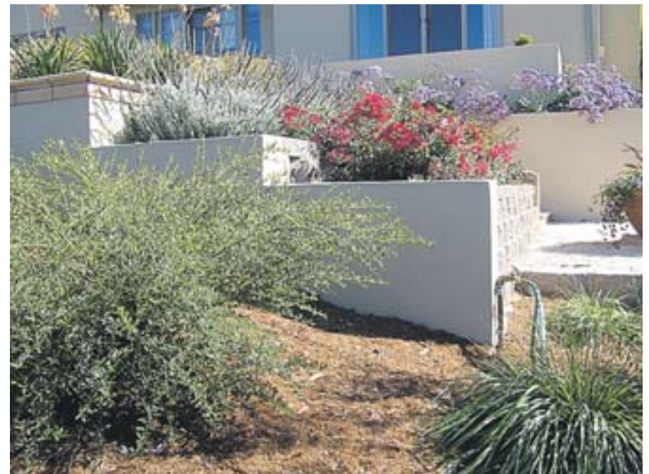
The red roses (fire) are balanced by the square planter (earth) that contains them and the green plants (wood) nearby