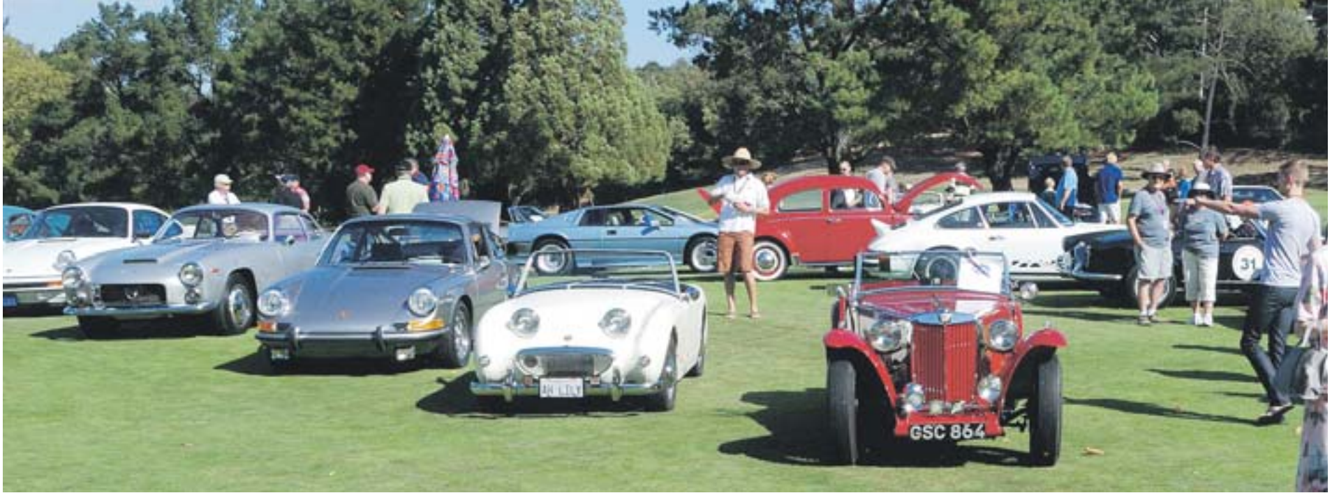
Cars will once again be displayed on the grass of the Orinda Country Club