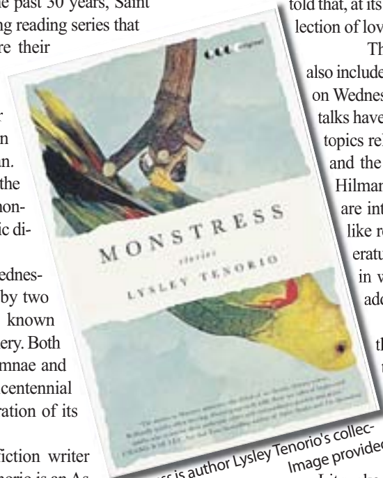
Monstress is author Lysley Tenorio's collection of short stories. Image provided

Tenorio's story collection is required reading for all incoming freshmen at SMC and for readers looking for a new, refreshingly unique Bay Area author. Monstress , the title story in the collection, is based on a really cheesy American sci-fi flick and an awful Filipino caveman horror film that were spliced together to produce what one critic described as the worst movie of all-time says Tenorio. An admitted sci-fi/fantasy movie and television junkie (his favorite TV show of all time is Buffy the Vampire Slayer ), Tenorio says this disastrous movie meld seemed like great material to explore. Despite the strange and outlandish plots and situations in Tenorio's book, he has been told that, at its heart, Monstress is a collection of love stories.