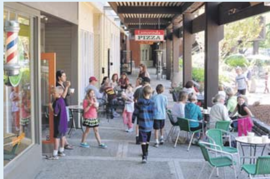
On the first day of school families enjoyed frozen yogurt from Tangelo, which recently opened at the Rheem Shopping Center.