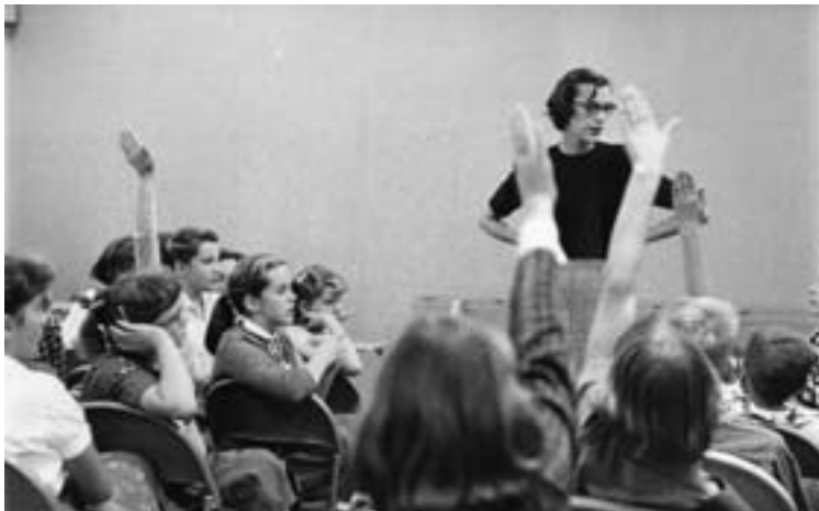
"Their spirits were always high and they had an extra eagerness to learn. The class had more than its share of leaders in all fields - scholastic, athletic and social. It made me feel good just to be with them," wrote Miller.