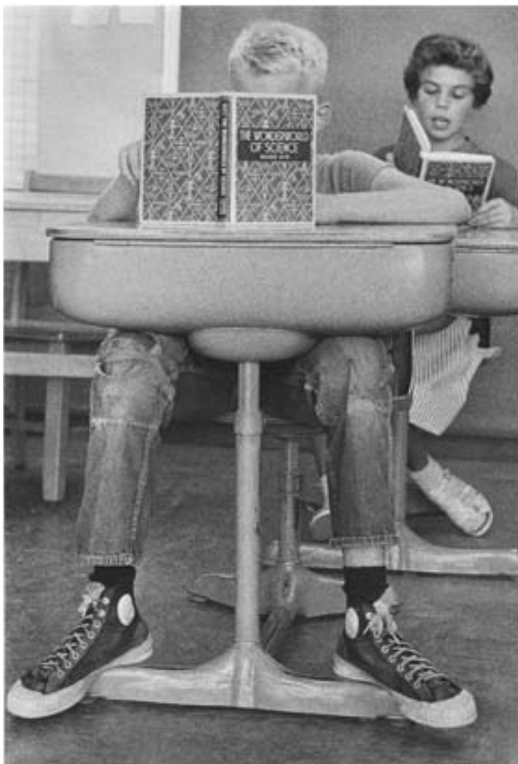
"In Sixth, you get down to business," wrote Miller of his sixth grade subjects at Glorietta Elementary School.