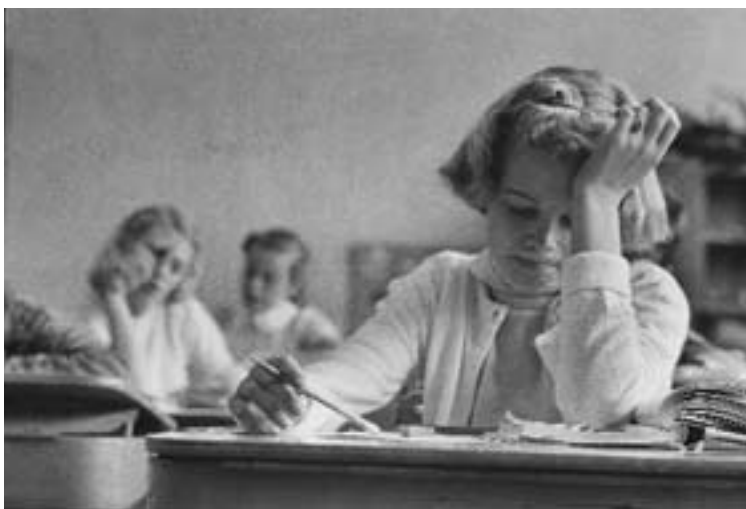
"Resignation," responded Miller when asked to describe this math test moment experienced at some point by every student, everywhere.