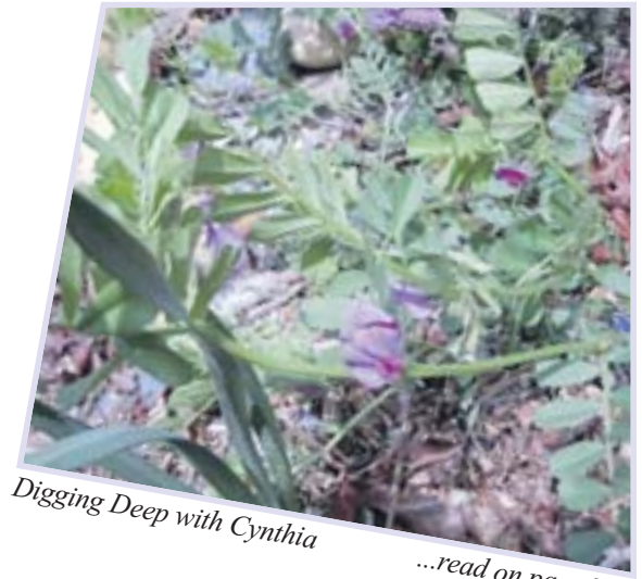
Digging Deep with Cynthia

Lamorinda Weekly Volume 06 Issue 15 Wednesday, September 26, 2012