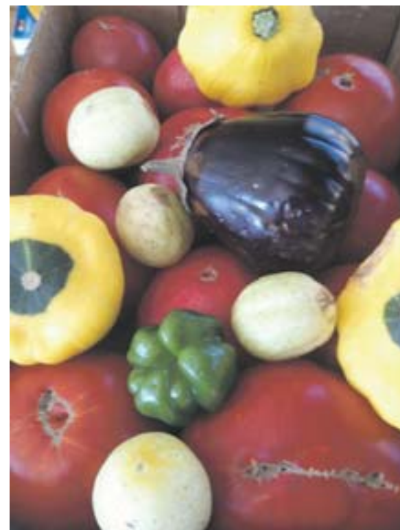
Final harvest of squash, cucumbers, eggplant, peppers, and tomatoes—plenty for a fall festivity.