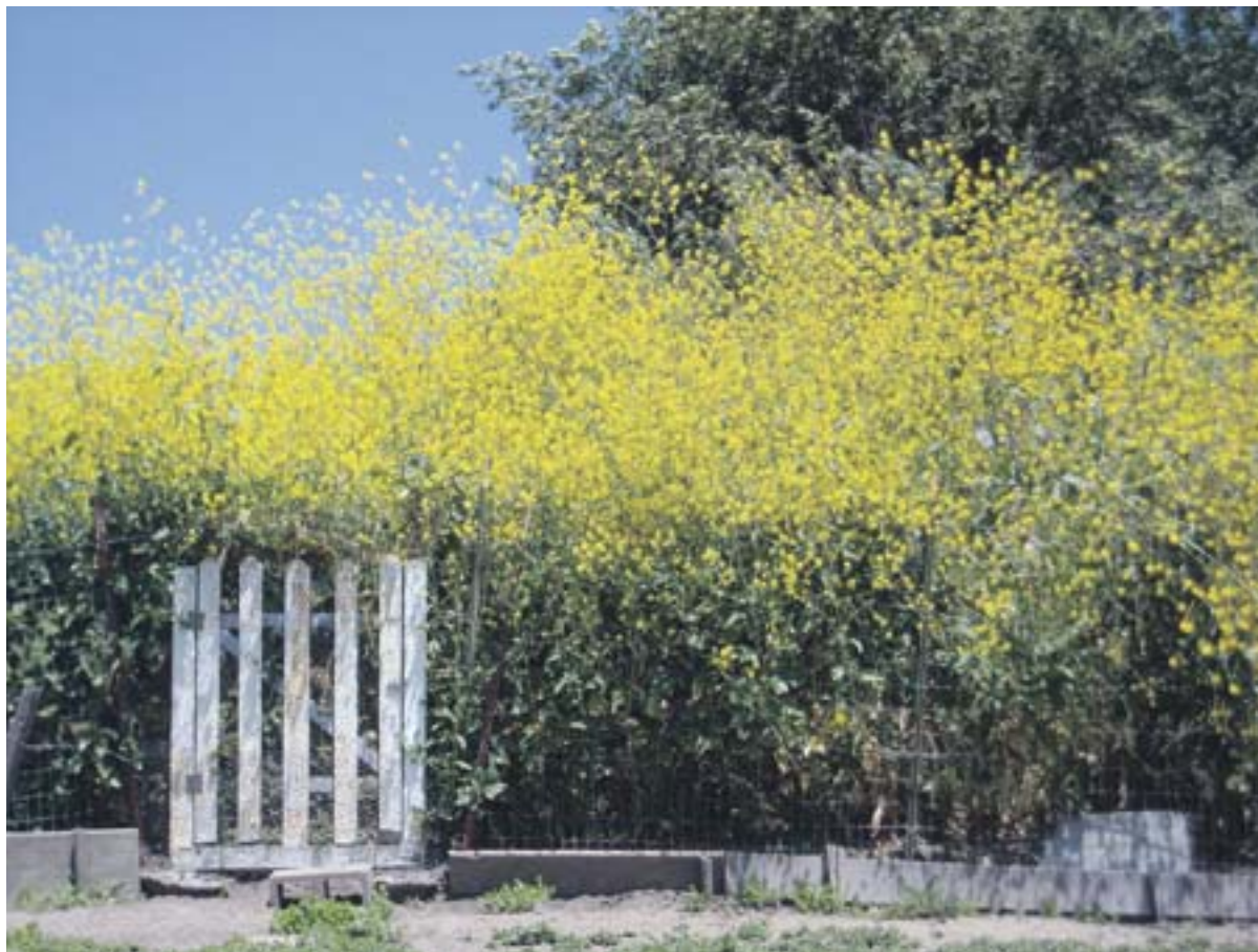
Mustard reinvigorates soil and is a great cover crop growing as tall as ten feet. It's edible and pretty, too.

“What I enjoy is not the fruits alone, but I also enjoy the soil itself, its nature, and its power.” Cicero