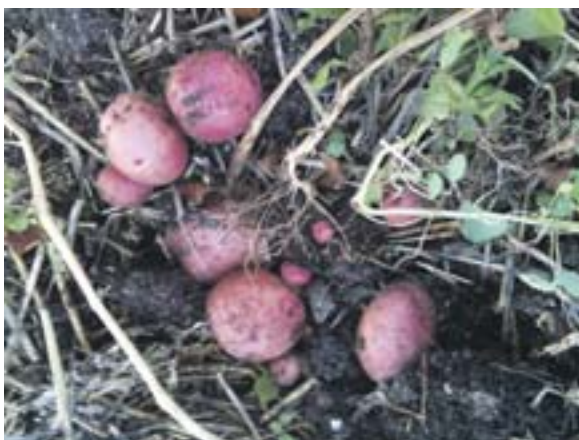
Cynthia's freshly harvested red potatoes. Easy to plant and grow. Delicious and nutritious. A great project for kids!

at least 18 inches deep, let your kids plant a slice from their favorite red, golden, or brown potato with two or three eyes up in a manure rich soil. Leaves will sprout, the plant will flower, and about 10 weeks later the po-