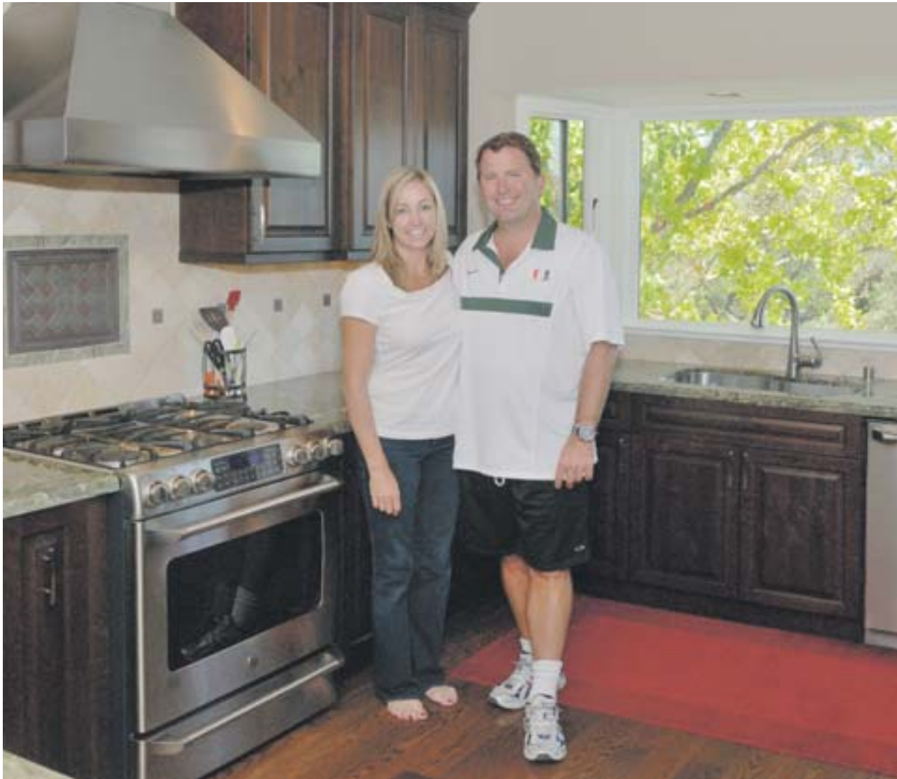
The Foleys chose rainforest serpentinite countertops in their remodeled kitchen