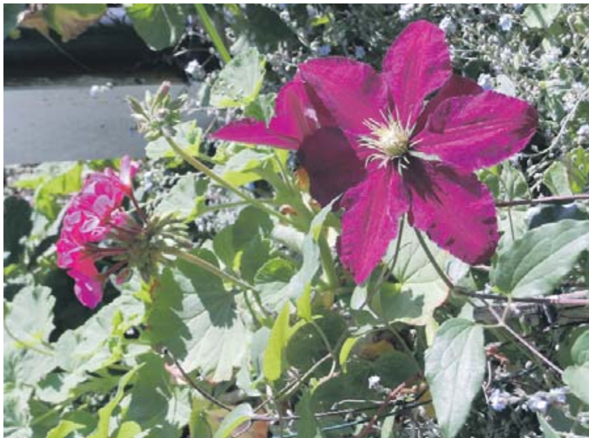
Clematis shines as it twines with forget-me not and geranium along a fence.