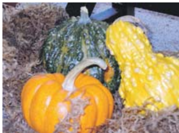
It's not fall without pumpkins and ghoulish gourds! If you don't grow them, find them at the farmers' markets.

Engage your children in garden based learning to spark their curiosity and grow their confidence with practical skills they will use forever. In a large container