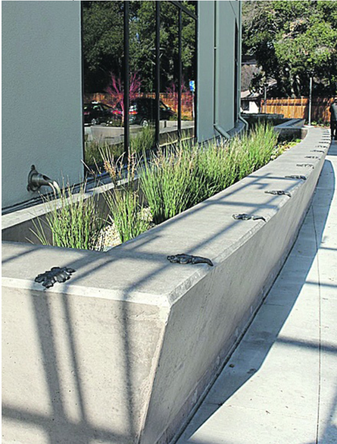
Water collecting planter at the Walnut Creek Library

Reach the reporter at: sophie@lamorindaweekly.com