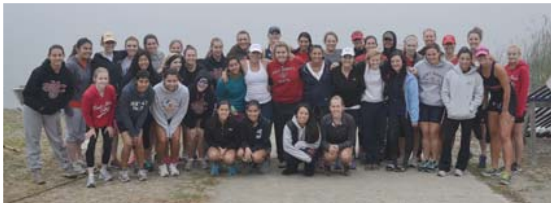
The Saint Mary's College Rowing Team