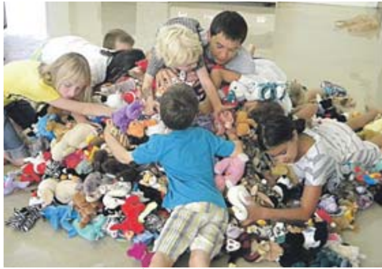
Holy Shepherd youth pray for those who will receive Beanie Babies.