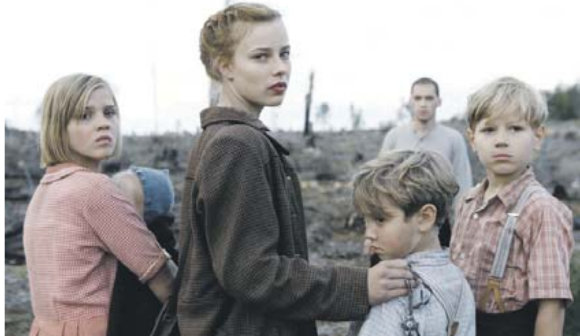
Lore will screen on Sunday November 11 at the New Rheem Theatre

Twitter has been buzzing for weeks regarding plans to celebrate the 15th anniversary of the California Independent Film Festival. This year's lineup includes programs for children, as well as another dazzling array of touching and thought-provoking films for adults.