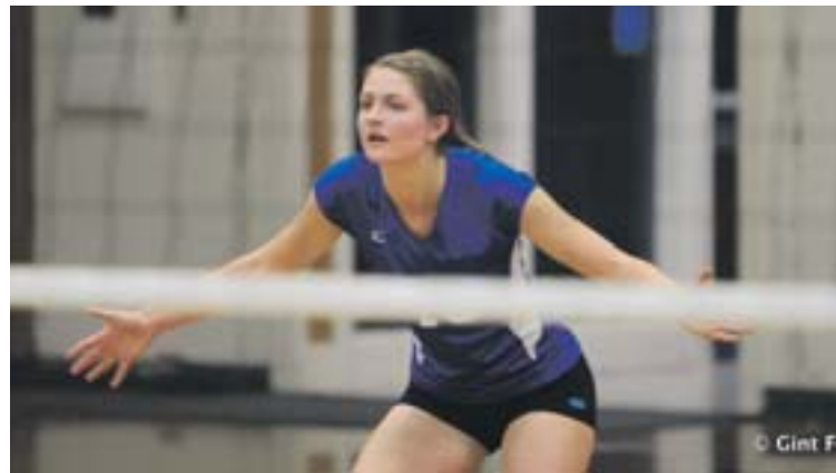
Brooke Aiello