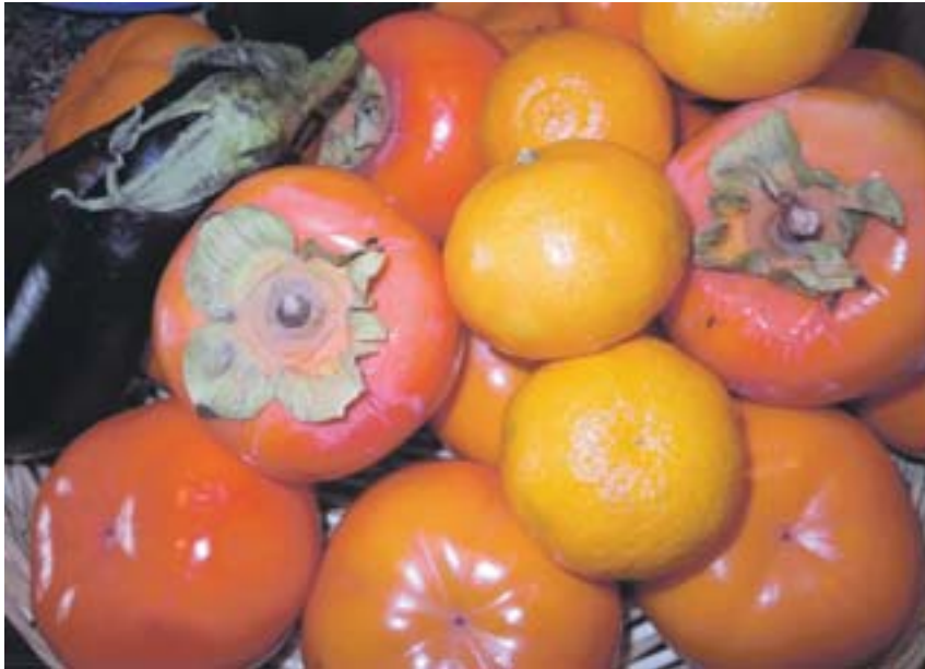
Fuju persimmons and tangerines are December treats. Fujus can be eaten like apples. Eggplants are still growing in the garden.

"Families are like fudge - mostly sweet with a few nuts." Author Unknown