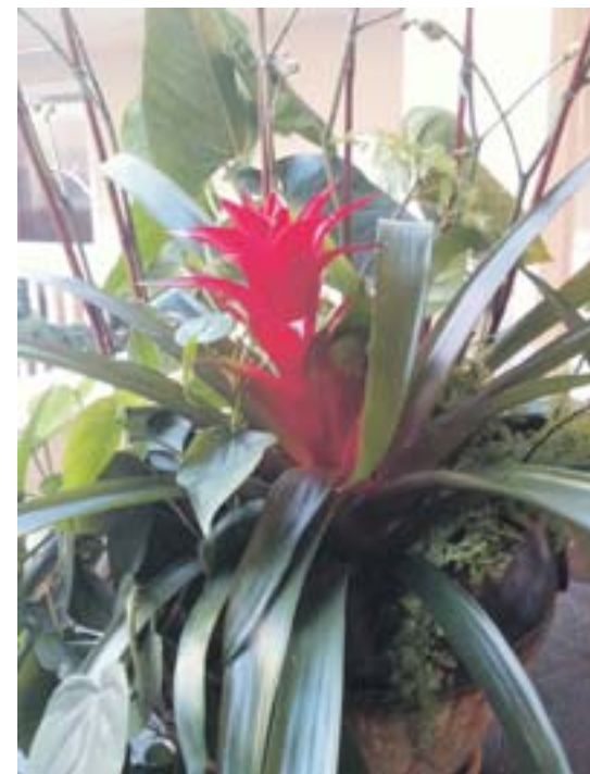
Bromeliads bring a bit of the tropics to the holiday season.