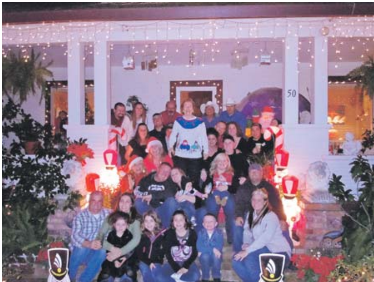
From my Farm Family to yours, Happy Holidays

As soon as the last of the Thanksgiving leftovers are devoured, most of us concentrate our attention on the December holidays. We climb into attics, scour garages, and check the back of our closets digging out ornaments and lights from last year's merriment. In the midst of our decorating fury, spending time in the garden is probably not at the top of most priority lists, yet devoting a few hours at the beginning of the month to hoe, hoe, hoe will add stockings full of joy to your ho, ho, ho.