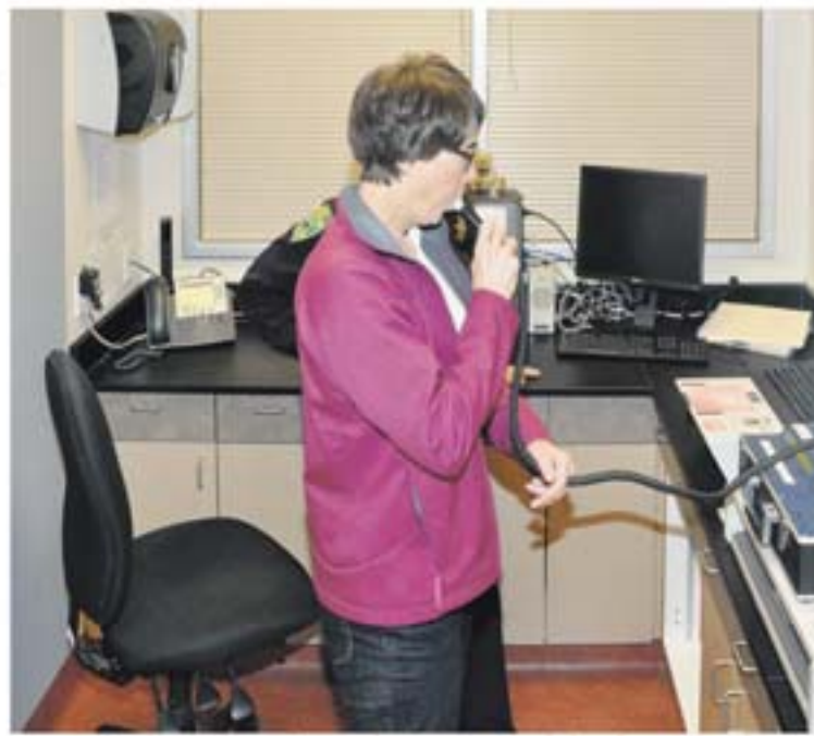
A second breath test is performed at the Moraga Police Department.