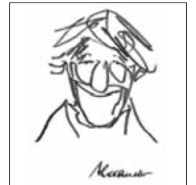
Self-portrait by Alexander Walchek

When asked to advise his nearly 80-year-younger co-exhibitor Meckes, Walchek suggested: "Have fun with your art. Be flexible: [be] open to other media, knowing you can stray and then come back to your art and bring something different to it each time."