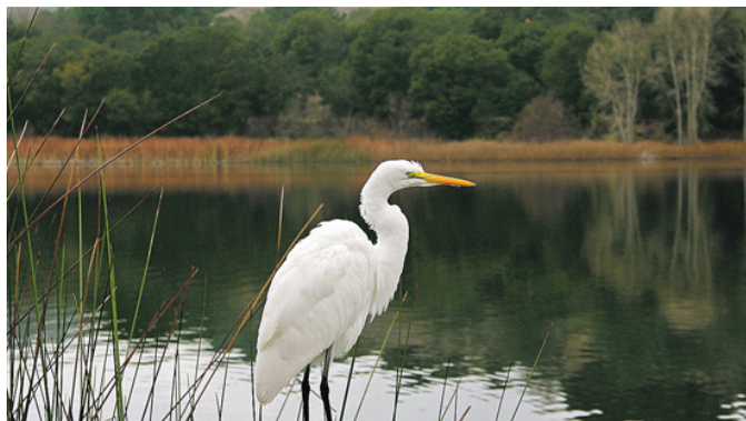
Great Egret