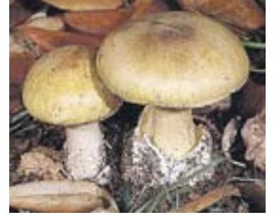
Death cap

When early and aggressive treatment is instituted, the overall prognosis is good. If a dog has just ingested mushrooms and not yet shown signs, he may be made to vomit. Additionally, a binding substance called activated charcoal will be introduced into his stomach to capture any toxin not yet absorbed into the bloodstream. This can be repeated several times over the next 48 hours in order to continue to bind active toxin. Further supportive care includes hospitalization, intravenous fluids, gastrointestinal medications for nausea and vomiting. Anti-oxidant medication can be given to further reduce damage to liver and kidney cells. Blood tests