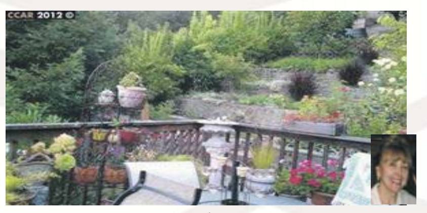
Orinda ~ 3 Bedroom, 2 Full Baths w/sky light. Master suite with walk-in closet covered with cedar wood and has sky light. Central Air, Wet Bar, Beautiful View. Great Balcony with overlook to Lake and Greenbelt of Orinda. Hillside covered with Flowers & Herbal Garden and much more! $800,000