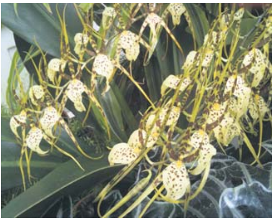
Spider orchids are beautiful indoors in January.