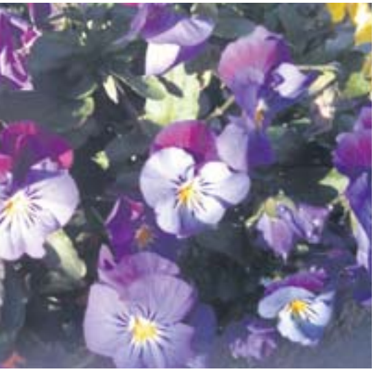
Violas and pansies perk up a dreary landscape.