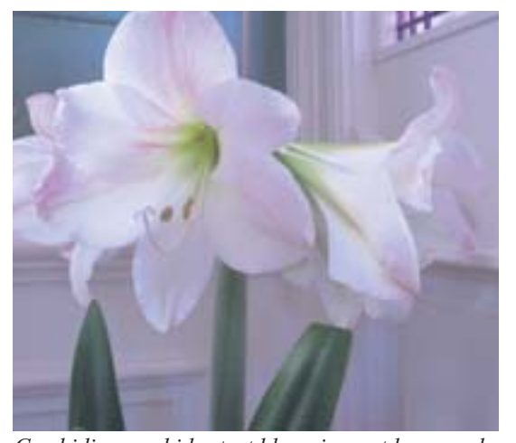
Cymbidium orchids start blooming outdoors and are great in or out.