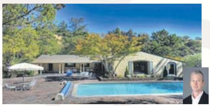
Lafayette ~ This is a special house with charm & character sitting on 1.2 acre's of nearly level land. 4 bed 4 baths plus 1 bed 1 bath cottage with kitchen. Large patio and pool, close to town. This is a wonderful opportunity! $1,490,000