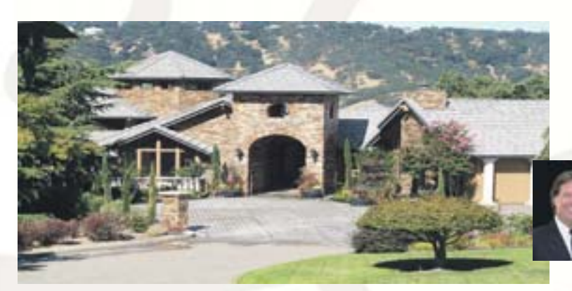
Alamo ~ European-inspired 6Bed, 5.5Bath, 5400 sf, move-in ready hm featuring views! Interior by J. Hettinger Interiors. *Times Featured Home; *SFGate Featured Home; *"Artful Living Tour Home". $2,288,000