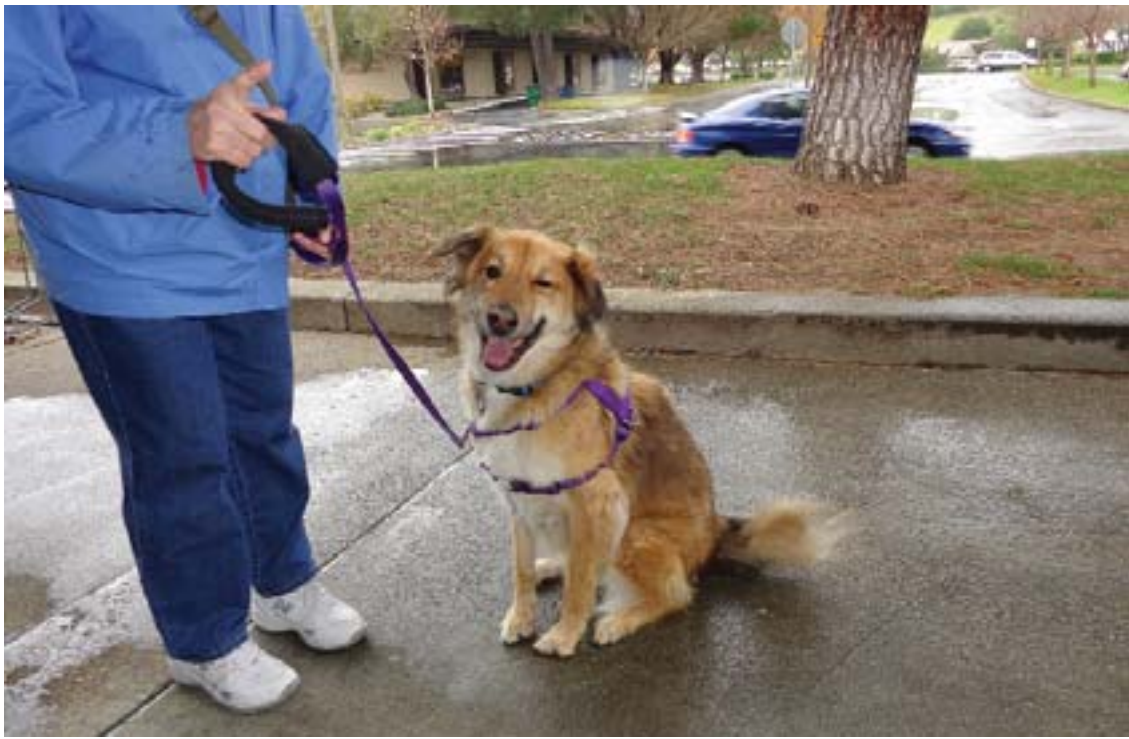
Tosca is a very energetic dog. Her owners borrowed that named from the famous opera because she's a diva. She was adopted from the Animal Rescue Foundation, her owners are unsure of her heritage but believe she is a Basque shepherd. Perhaps she knows if she sits nicely for the photographer there's a treat coming, she shares a knowing wink.

H ave leash, will travel. Pampered pooches in Moraga need not wait for the sun to come out to enjoy a walk. The relatively long covered promenade that skirts the Rheem Valley Shopping Center appears to be the place to go when it's raining and your canine companion needs a little recess. From Home Goods to the Rheem Theatre, with little parklets of grass, even a pet store near Nations for last minute treats, on any given rainy day a variety of dogs and their owners are happy to share a sniff and say hello.