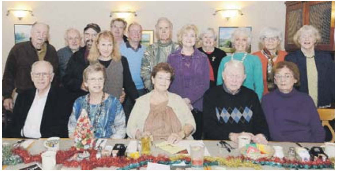
Former Laf-Frantics members gather for their annual holiday brunch at Terzetto in Moraga.