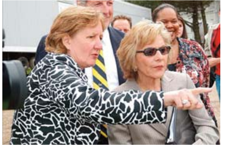
Mayor Amy Worth's Orinda City Council colleague, Victoria Smith, has dubbed her "the mother of the fourth bore." Worth is shown here in 2010, clarifying a point for U.S. Senator Barbara Boxer (D-CA).