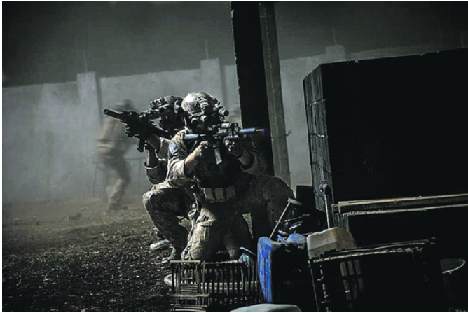
Zero Dark Thirty