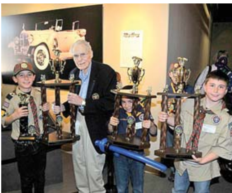
Local Cub Scouts are laden with trophies and smiles at a recent Blackhawk 500.