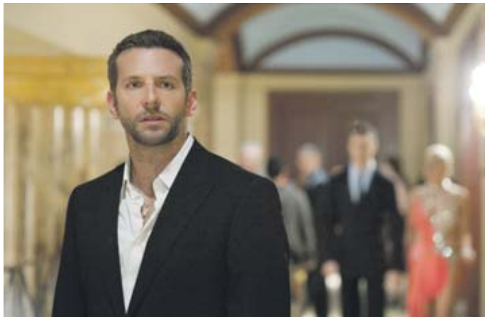
Best Actor Oscar nominee Bradley Cooper as Pat Solitano.

If you live long enough you begin to realize that life is always a bed of roses – thorny. "Silver Linings Playbook" addresses real life issues and that is why the movie hits home to so many people. It is an outstanding independent film, which had its world premier at the 2012 Toronto International Film Festival. "Silver Linings Playbook" is not coated with Hollywood sugar. I use "Argo" as an example: a true story and a great film but did the police really chase the plane on the tarmac? That scene is Hollywood sugar coating.