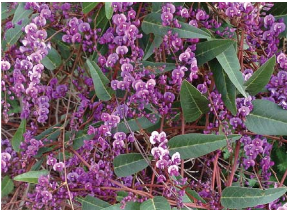
An old fence gets a colorful make-over with Hardenbergia violaceae, the purple lilac vine

“A liquid moon moves gently among the long branches. Thus having prepared their buds against a sure winter, the wise trees stand sleeping in the cold.” William Carlos Williams