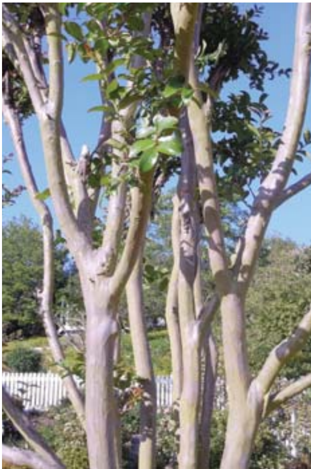
The crape myrtle tree offers four seasons of beauty, including the peeling and colorful bark.

196 Moraga Way • Orinda • (925) 254-3713 • Open Daily