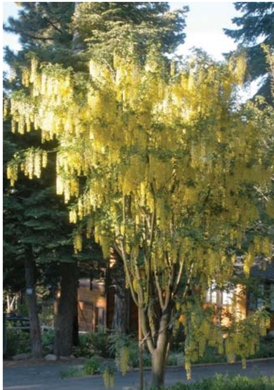
Who can resist the shimmering clusters of brilliant blooms of the Golden Chain tree?