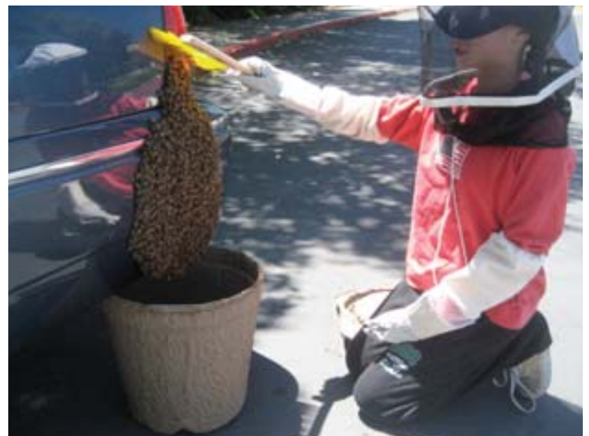
Bee swarm removal