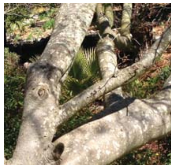
The mottled trunk of a Japanese maple is beautiful any time of year.

In winter months, unless we are in the Sierras admiring the snow-clad conifers, most of us tend not to take a good look at our leafless trees. We enjoy the beautiful spring flowers and the fabulous fall foliage, without ever paying attention to the bare bark. Although as children we normally color branches with