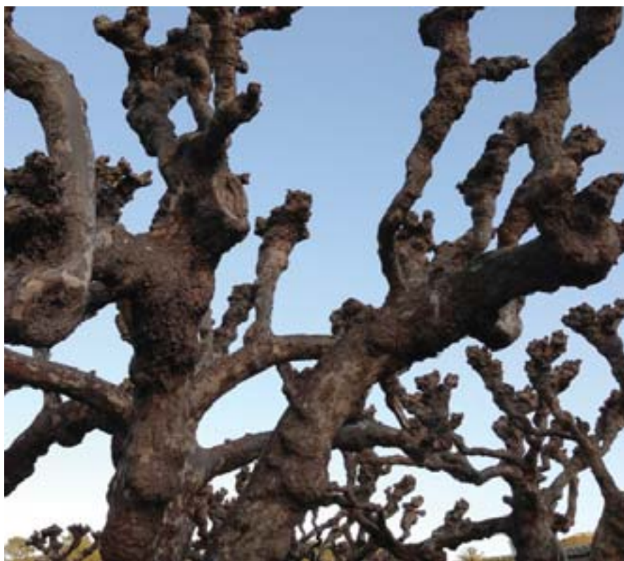
The knots and gnarls of a pollarded tree is reminiscent of a haunted forest.

Before all the leaves spring forth in your home forest, take a walk outside with