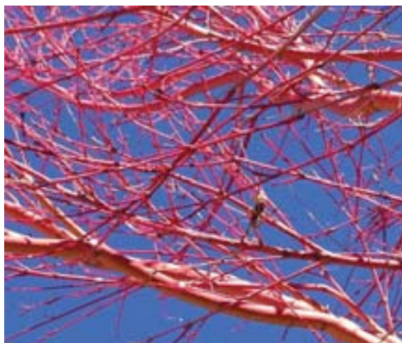
The coral colored twigs of the red branch Japanese maple add sparkle to the blue sky.

I was wrong! Oh, so wrong! And how thrilled I am that I was. One would think that history would be the precedent, but as in stock warnings, past performance is not an indicator of the future. After decades of dismal, dreary, drab Februarys, Mother Nature decided to march on with an early spring in the second month of this new year! Only a few wet weather days tarnished the mostly sunny daylight hours, frosty mornings, and very cold nights. It has been a cheery month, not dreary in the least.