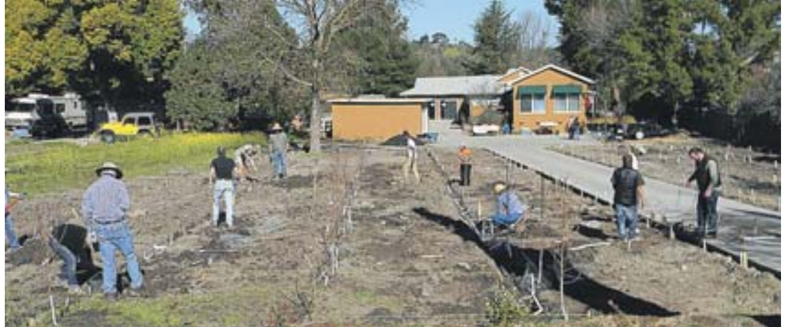
Local volunteers including members of the Lafayette Community Garden, The Urban Farmers, and Youth Homes, Inc., help plant at the Cherry Lane Residence in Lafayette off Pleasant Hill Road.

As part of its successful job training program for current and former foster youth, Youth Homes planted the Youth Homes Promise Orchard Feb. 14, which consists of 100 trees at its Cherry Lane facility in Lafayette. Youth Homes worked collaboratively with key partners including the Lafayette Community Garden as well as The Urban Farmers in coordinating this project.