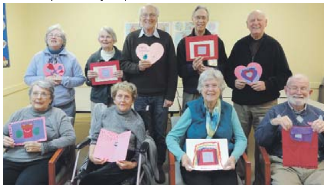
Lamorinda Adult Respite Center participants show off their valentines.