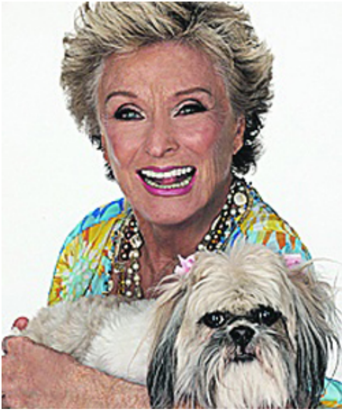
Cloris Leachman

Reach the reporter at: info@lamorindaweekly.com