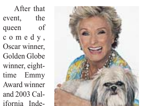
Cloris Leachman