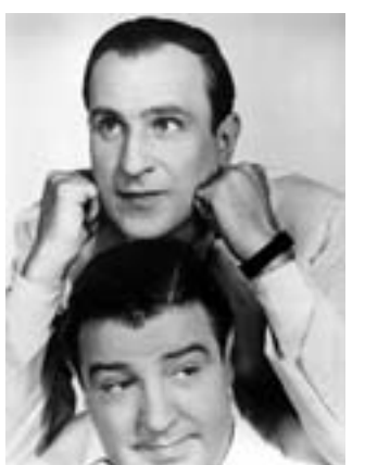
Abbott and Costello

The stars will be shining brightly on the weekend of May 10-12 in Lamorinda at the first semiannual Classic Film Festival and Hall of Fame ceremony. Described below are a few of the events occurring that weekend.