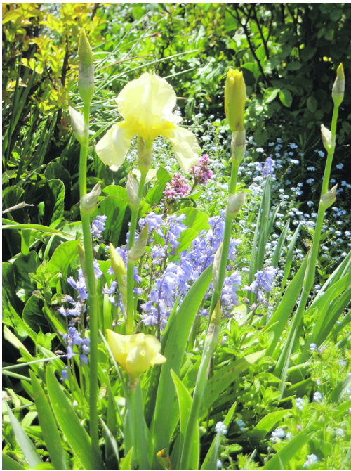
Bearded iris amidst forget-me-nots and woodland hyacinths.

Reach the reporter at: info@lamorindaweekly.com