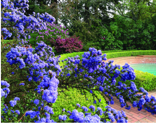
Ceanothus, known as California lilac, French lilac, and wine-hued weigela flank the boxwoods and the brick-lined pool.