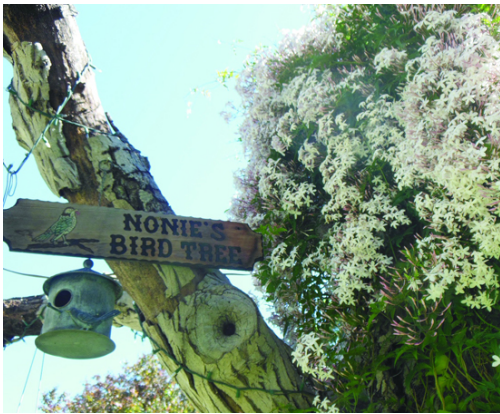
The jasmine wafting from Nonie's bird tree is intoxicating.