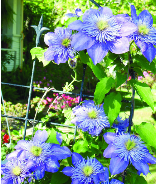
Ice blue clematis is a vertical climber.