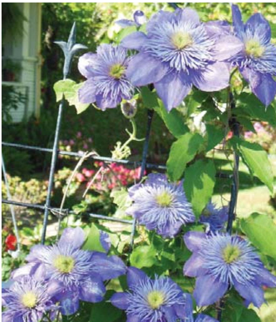
Ice blue clematis is a vertical climber.