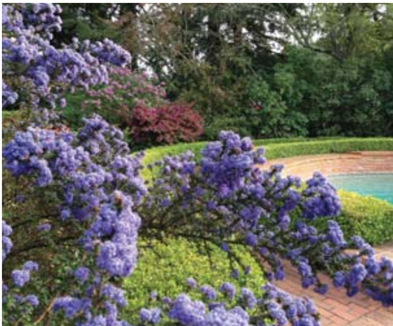
Ceanothus, known as California lilac, French lilac, and wine-hued weigela flank the boxwoods and the brick-lined pool.