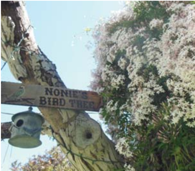
The jasmine wafting from Nonie's bird tree is intoxicating.