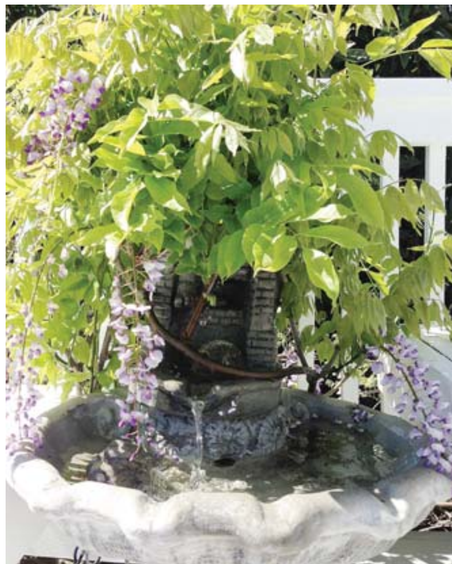
Fragrant purple wisteria winds around the gurgling fountain.

Robert Fulghum may have learned everything in kindergarten, but since I didn’t attend kindergarten, I learned everything I needed to know about life in a real garden ... my mom’s garden. And all I had to do was utter, “Mother, may I?” Thank you, Mom!