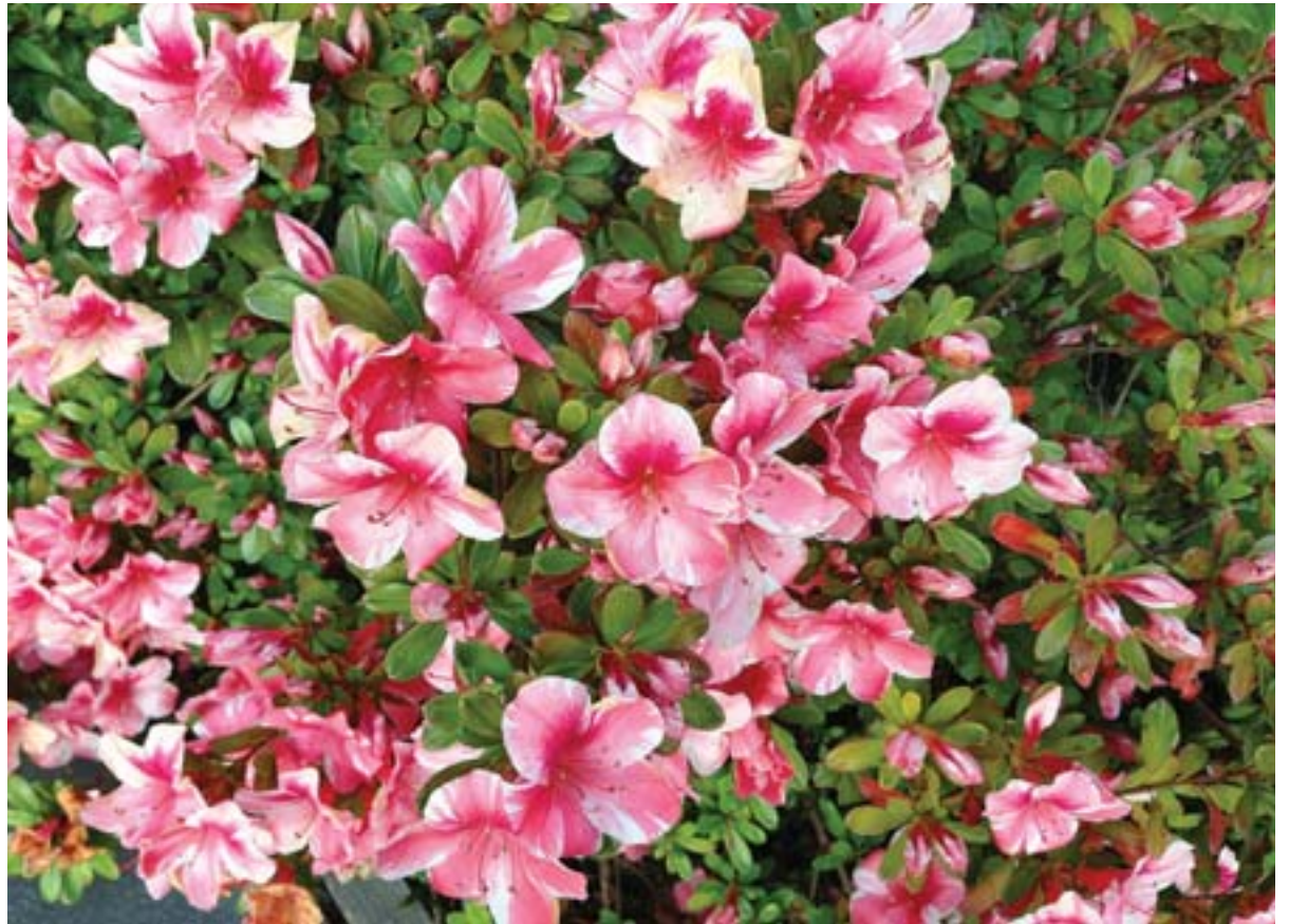
Pink striped azalea looks like a spring candy cane.