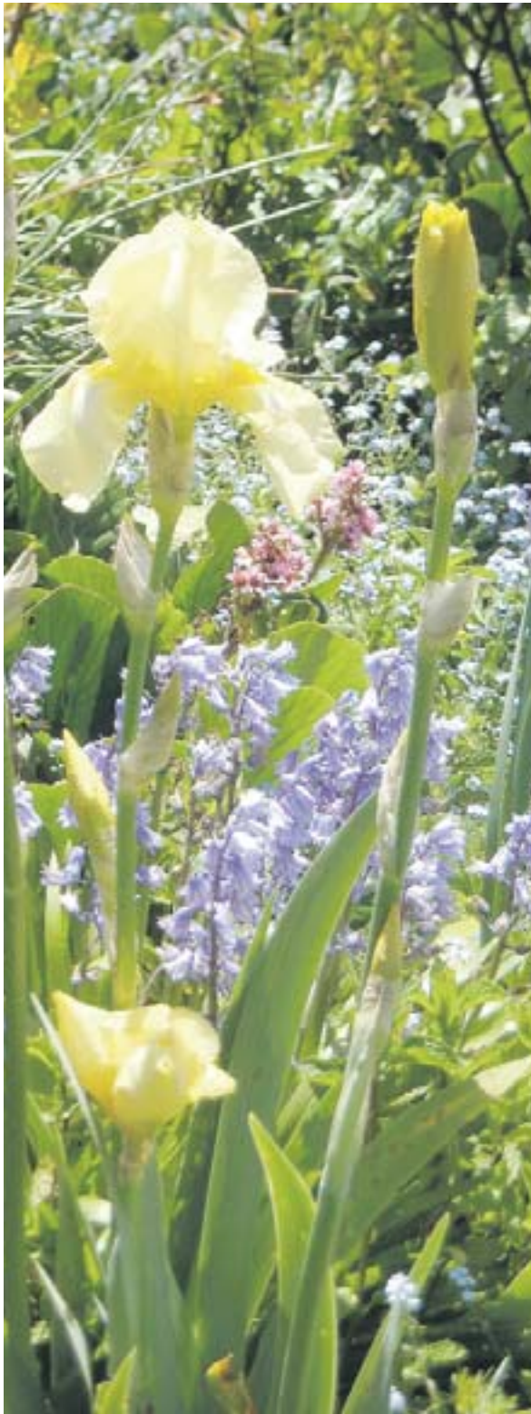
Bearded iris amidst forget-me-nots and woodland hyacinths.

196 Moraga Way • Orinda • (925) 254-3713 • Open Daily