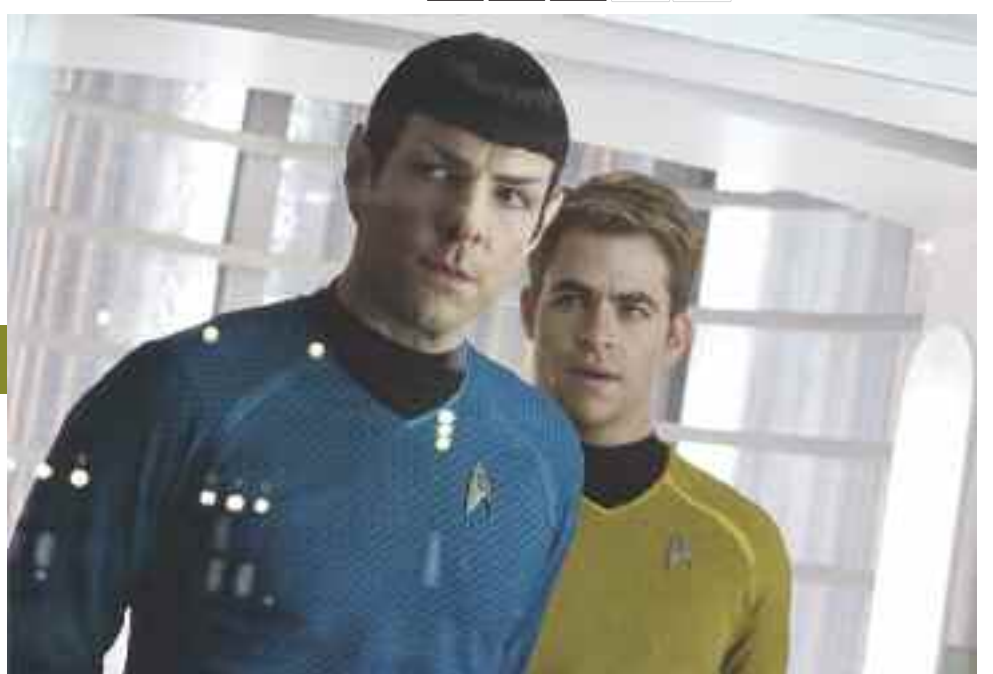
From left: Zachary Quinto is Spock and Chris Pine is Kirk in "Star Trek Into Darkness" from Paramount Pictures and Skydance Productions.

O ne of the most famous quotes in the Star Trek legacy is "Where no man has gone before!" This film is a huge undertaking for any director of the Star Trek franchise that has created more than 700 television shows and 12 movies.