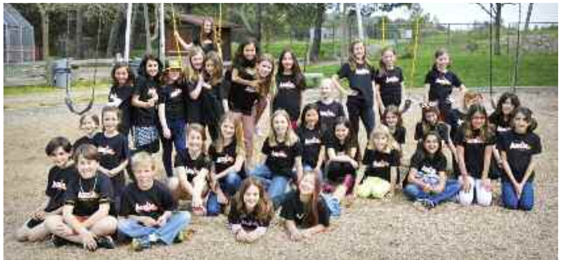
Cast of "Annie" at Wagner Ranch