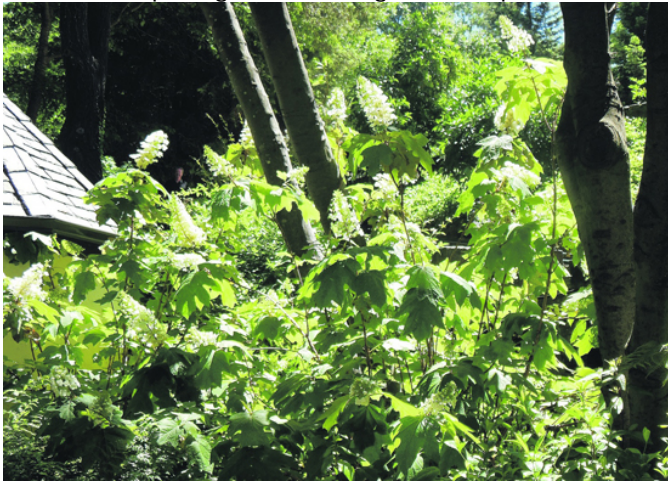
Lacy oak leaf hydrangeas thrive in the mottled shade.