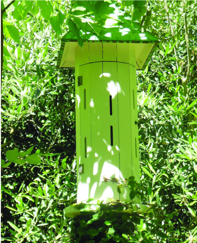
Invite butterflies to your garden by adding a butterfly abode to your landscape.