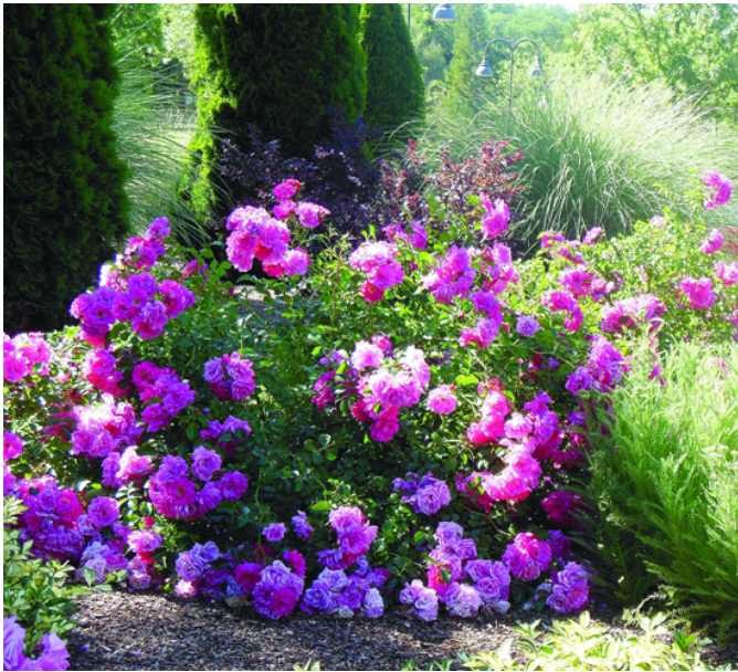
Carpet roses, cypress trees, and grasses make great cut bouquets for any gala gathering.