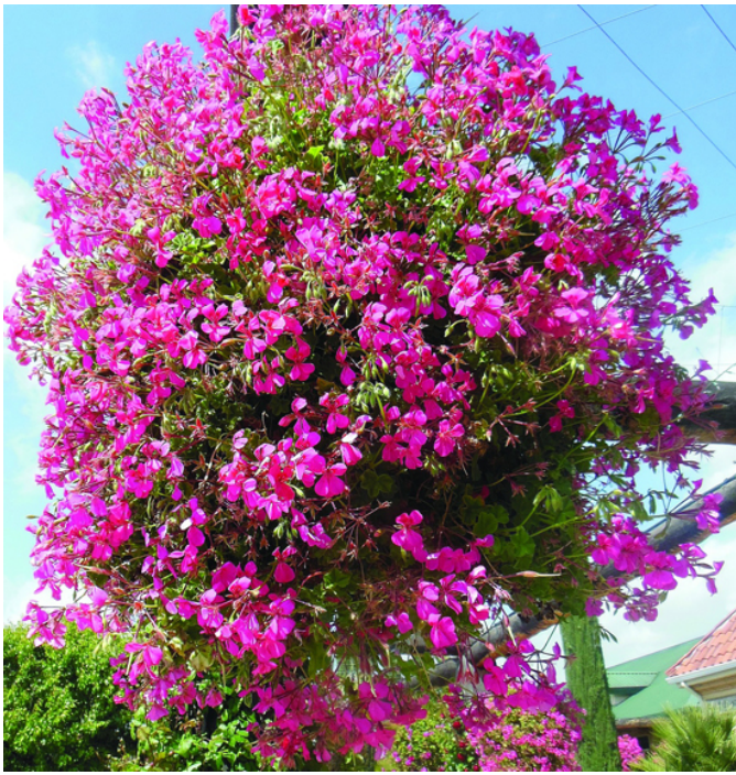
A basket of pelargoniums hangs from a pole to create a ball of fiery sparkle.