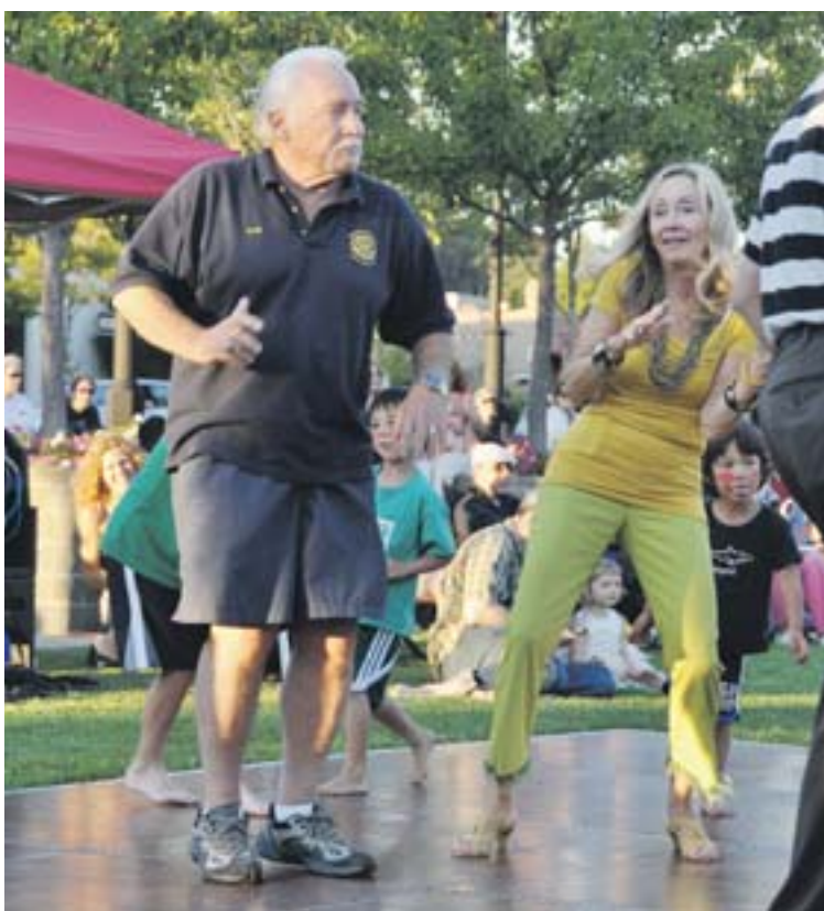
Community members of all ages enjoyed last year's concerts.

For three hopefully warm Friday evenings beginning June 14, a stellar line up of musical talent will be enlivening the twilight hours at Plaza Park at the corner of Moraga Road and Mt. Diablo Boulevard. Earlier than ever this year, before everyone goes on vacation in August, starting on Flag Day from 6:30 to 8:30 p.m., Rock the Plaza's complimentary concerts are harmoniously poised to groove into the weekend and inspire the inner groupie in Lamorinda residents.