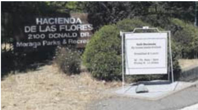
The café's A-frame sign received approval.