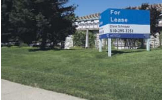
This vacant business sign along Moraga Road is non-compliant.