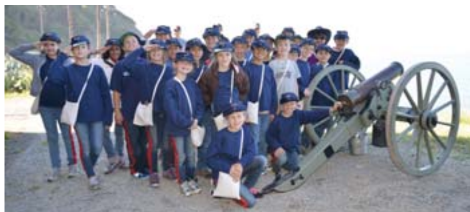
Los Perales fourth-graders dress as U.S. Army soldiers from 1864.