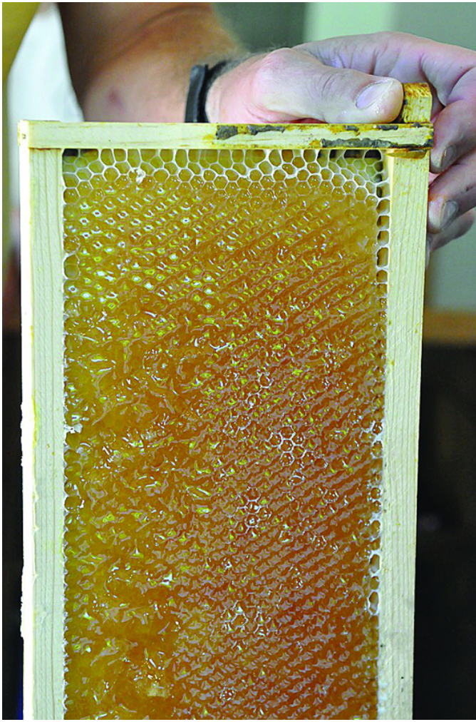
Uncapped honey