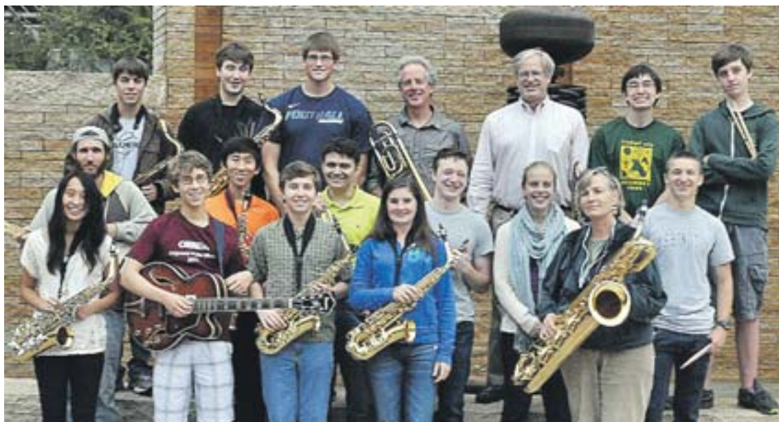
EFO Big Band members enjoying a short break at weeknight practice. If you are out of town for July 4, you can catch the band playing in the Orinda Community Park on July 16.