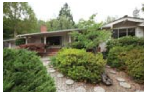
JUST LISTED! 8 Sager Court, Orinda 4BR/2.5BA, 2075± sq. ft. Offered at $819,000