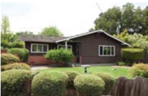
JUST LISTED! 1012 Larch Avenue, Moraga 3BR/2BA, 2806± sq. ft. Offered at $850,000

The real estate market is still HOT! Limited inventory coupled with lots of eager buyers is driving up housing prices, but also slowing down sales activity. Now is the time to sell your home!