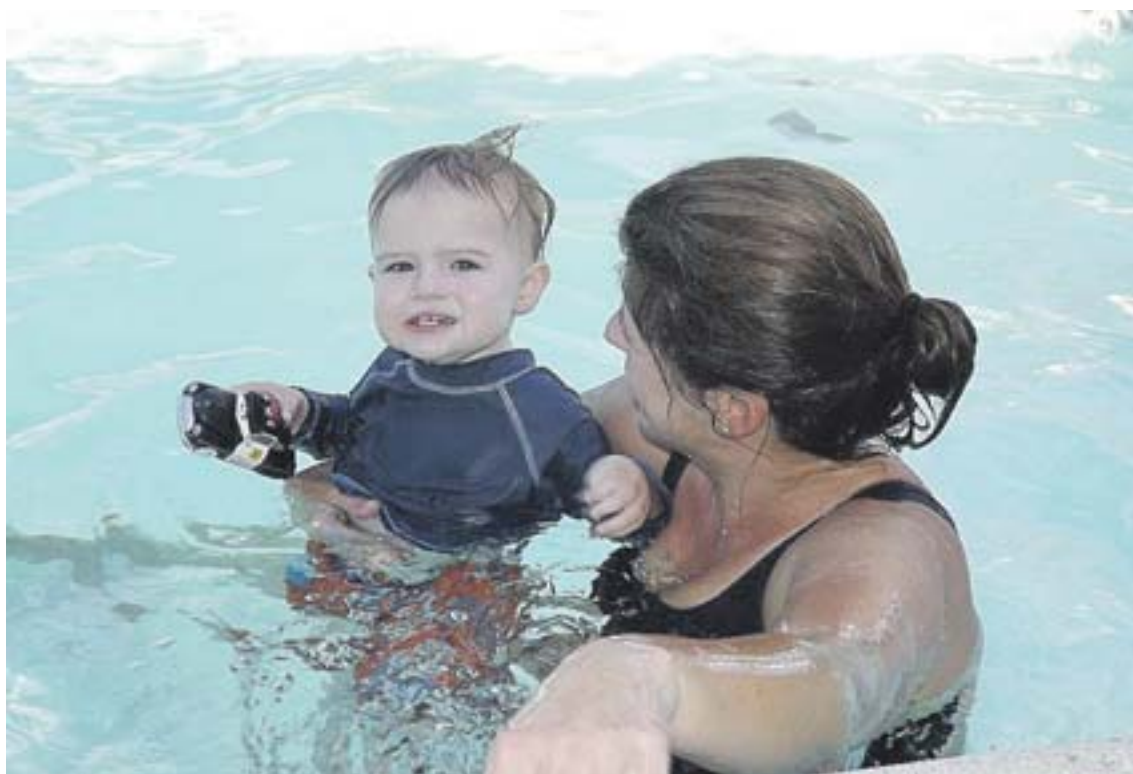
A toy is a great distraction for this tiny swimmer.