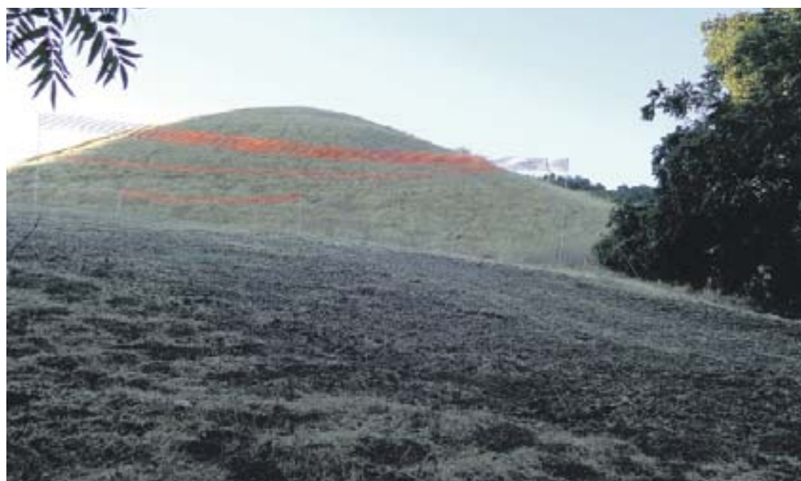
Orange netting and story poles give a sense of the size of the home slated for Happy Valley Road.

Although the project by Melcor Homes on a steep, subdivided parcel on Happy Valley Road was be-