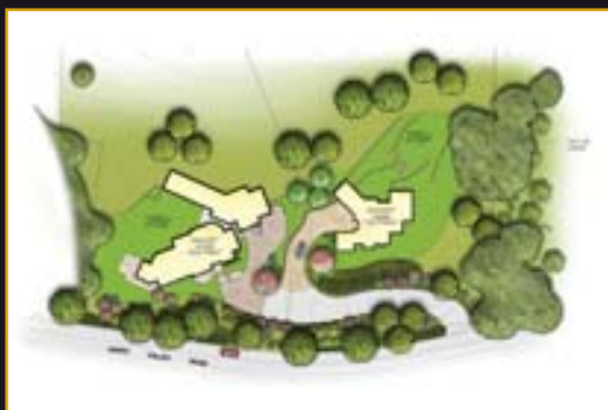
Happy Valley Road Lafayette

New construction! Unbelievable estate property on over 7.5 acres on desirable Happy Valley Road. Available for presale and built to suit.