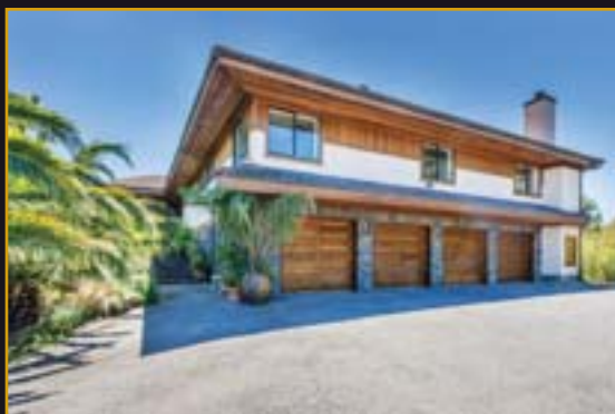
179 Crestview Drive Orinda

Connect with us today & experience the APR difference for yourself.