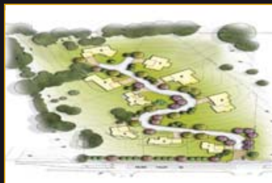
Reliez Valley Lafayette

New gated community in Reliez Valley. Nine new homes on large lots with incredible views. Available for pre-sale and built to suit.