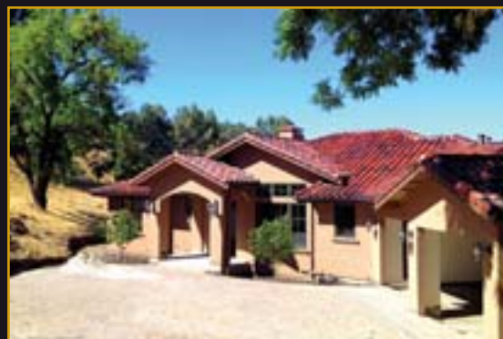
1740 Toyon Road Lafayette

Dream home with breathtaking views! One of a kind, Tuscan-styled, 5 bedroom, 3.5 bath home that exudes a passion for living. No detail overlooked!