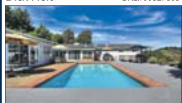
ORINDA $2,200,000 6/5. Great entertaining home w/panoramic views. Stunning pool w/flat yard on level site. Laura Abrams BRE# 01272382