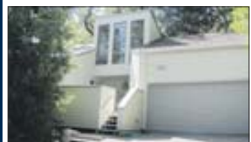
LAFAYETTE $985,000 2/2.5. Architectural Gem. 2600 +sf. Quiet yet conv. Loc. HV sch. Dist. 2 bonus rms. Dick Holt BRE#00827803

348 Rheem Blvd, Moraga CA 94556, 925.376.5995