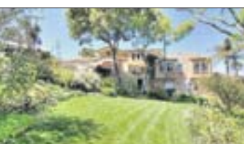
ORINDA $3,650,000 4+/4.5. Romantic, Contemporary Villa Built in '90 on 1.3 Ac with Amazing Gardens, Vistas & Privacy. The Hattersley's BRE# 01181995/00445794