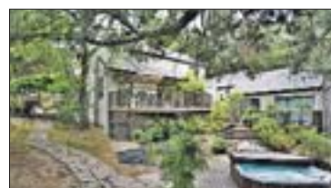
LAFAYETTE $1,150,000 4/2.5. Custom contemporary, on a cul-de-sac. Bkyrd w/deck and patio. Lafayette schools. Val Durantini BRE#01376796