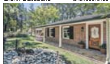
ORINDA $999,000 3/2.5. Beautifully updated contemporary Rancher. Lrg outdoor space for all year round entertaining. Finola Fellner BRE#01428834