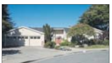
MORAGA $1,299,000 4/2.5. 1-story on cul-de-sac. World class views. Pool, level yard, extensively remodeled. The Holcenberg Team BRE#00637795/01373412