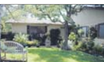
ORINDA $1,038,000 4/2.5. Single story, lrg master suite, hardwood floors, view, over 2300 sq ft on 1/3+ usable acre. Jim Ellis BRE#00587326

5 Moraga Way | Orinda | 925.253.4600 2 Theatre Square, Suite 211 | Orinda | 925.253.6300