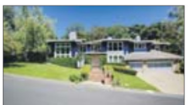
ORINDA $2,290,000 5/4.5. Orinda Downs Beauty. Apprx 5200 sq.ft, fabulous updated kitchen, game rm, lrg Mstr Ste, deck with views! Fellner/Stryker BRE#01428834/01290021