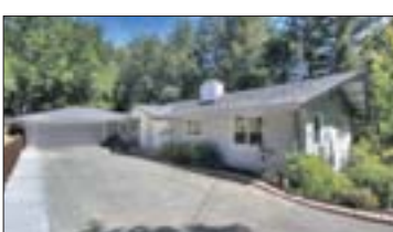
LAFAYETTE $1,094,999 4/2.5. Rarely offered, this hm is located in the heart of Lafayette. Beautiful wooded & hill views. Linda Van Drent BRE#01051129