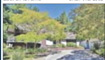
ORINDA $1,595,000 3+/2.5. Over 3500 sq.ft on .67 acre lot. Lrg bdrms plus game rm. Across Dalewood park. Maram Bata BRE#01435229