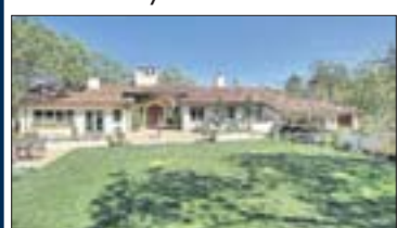
ORINDA $3,200,000 5/4.2. Spanish Mediterranean Country Club with lake views. Small vineyard & lvl yard. Stunning! Fellner/Molloy BRE#01428834/01910108