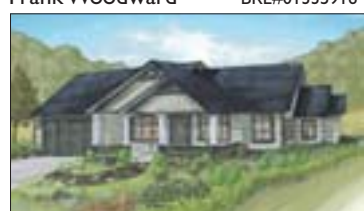
ORINDA $1,950,000 3+/3.5. New construction, single lvl custom hm. .87 acre lot w/views. More at OrindaOaks.com. Glenn Beaubelle BRE#00678426